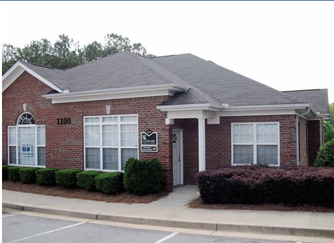
Building 1100, Roswell, Georgia 30076