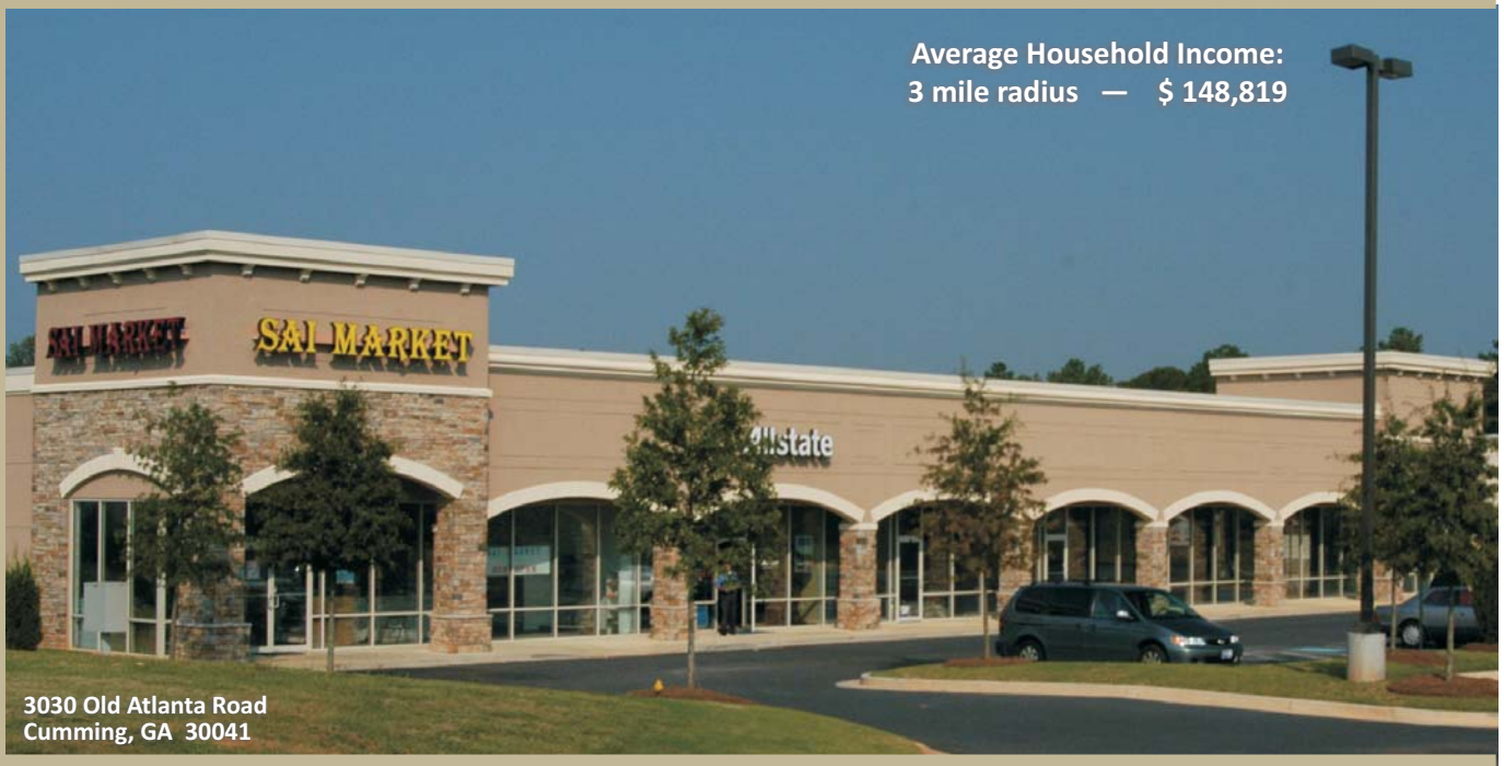
3030 Old Atlanta Road Cumming, GA 30041

Average Household Income: 3 mile radius — $ 148,819