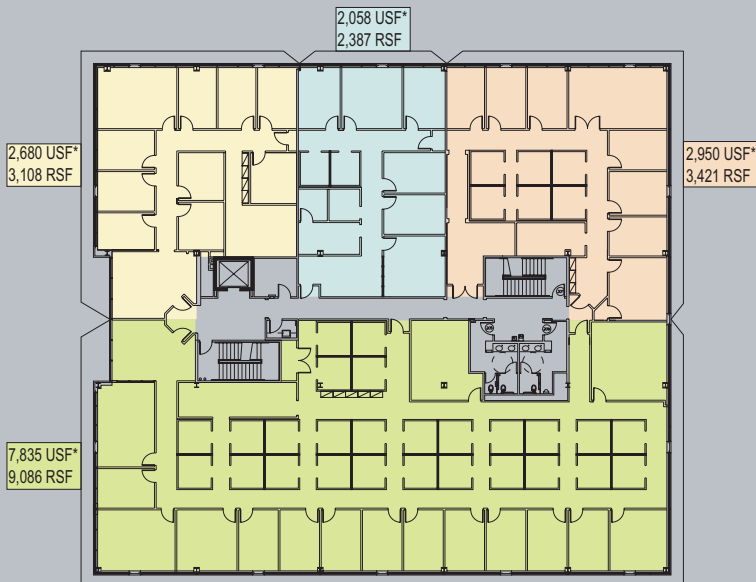
2nd Floor - Sample Layout Plan ■ Approx. 18,000 RSF * Square footage shown is approximate