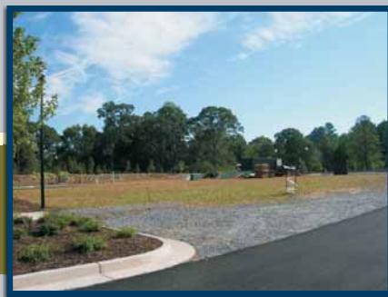
Retail Pad Site to Right of Existing Building