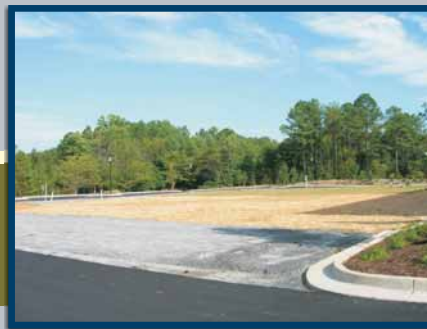
(2) Pad Sites to Left of Existing Building