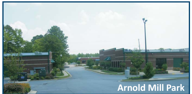
Arnold Mill Park